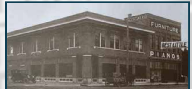
Early 20th Century, 1910s, F.M. Christensen Drug Store & Odd Fellows Fellowship Hall

Enjoy a walk through Tremont while learning about the history and architectural styles of many beloved buildings with this self-guided walking tour.