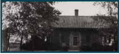
Spanish Colonial Revival, 1930

Tremont Library opened to the public in 1930, after 16 years of dedication and hard work. During these 16 years, the Economic Club put up a library shelf in various places including a hat shop, in the back of the bank, and later in the Waldron Building. The Club contributed $3,000 to the construction of the library after holding many fund-raising projects including book showers, bake sales, and the May Festival. Since its first opening it has undergone two remodels while maintaining a Spanish Colonial Revival architectural style. The first remodel in 1984, added the west wing, and in 2005 the ceiling was raised and braced.