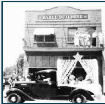
Early 20th Century, 1930