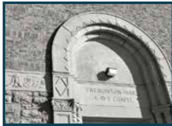
Spanish Colonial Revival, 1928

Built in 1928, the Tremont 1st Ward of The Church of Jesus Christ of Latter-day Saints was built in a Spanish Colonial Revival style. This is characterized by its rounded arch openings, and low-relief ornamentation. Since its dedication, the red tile roof has been replaced.