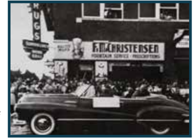
Early 20th Century, Early 1910s

Northern Furniture was built in early 1910s and was used as the City drug store, owned by F.M. Christensen. It was built during the building boom in Tremont (summer of 1912 to end of 1914) with the entry originally on the corner of Main Street and Tremont Street. The entry now faces Main Street.