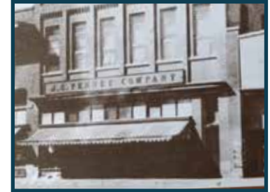
Early 20th Century, Early 1900s

Built in early 1910s with an Early 20th Century style, the Museum was originally an Odd Fellows Fellowship Hall. Since then it has been a furniture store (Stohl Furniture Store), a clothing shop (J.C. Penney), a furniture store again (Northern Furniture), and most recently the Bear River Valley Museum. With just a few steps inside, one can enjoy the original wood flooring.