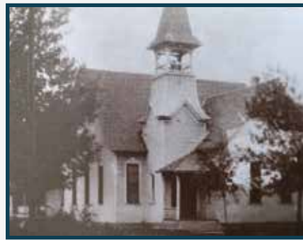
Victorian Gothic, 1892

"Although the Methodists had purchased a site in 1903, they did not build a church until 1905. This building was made possible by the offer of an abandoned church building in the Upper Cache