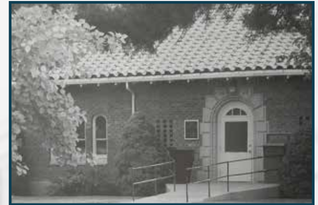
Spanish Colonial Revival, 1930, Tremont Library

Enjoy a walk through Tremont while learning about the history and architectural styles of many beloved buildings with this self-guided walking tour.