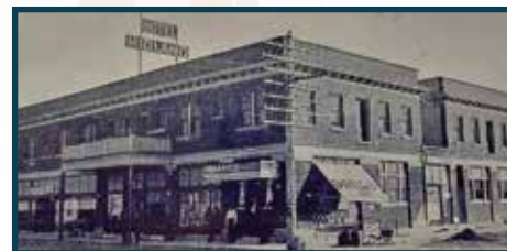
Early 20th Century, 1912-1914