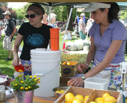
Cache Valley Gardeners Market - Utah