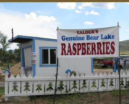
Calder's Bear Lake Raspberries - Utah