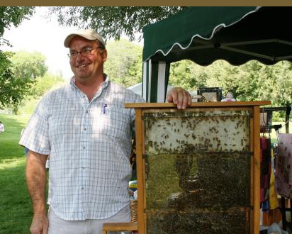
Slide Ridge Honey Demonstration Beehive