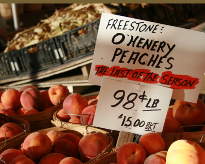
Fresh Peaches at Fruitway Market - Utah

In the Bear River Heritage Area (BRHA), ranching and agriculture are still primary occupations that sustain a rich agricultural heritage. Historically, Shoshone Indians hunted plentiful wild game, gathered seeds and berries, and farmed in small amounts. In the 19th century, Mormon settlers developed the Bear River and its tributaries to increase agriculture. Agriculture brought in new cultural groups with their traditions and celebrations, including Japanese-Americans, Latinos/as, Asians and Eastern Europeans. This tour lists some well-established family owned businesses that are known for their quality products and services. More and more people are turning to heritage rich resources such as orchards and small farms, dairies, home gardening and canning—to name a few—and establishing new businesses each year. Look for them as you travel the Bear River Heritage Area.