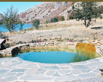
Maple Grove Hot Springs – Thatcher, ID