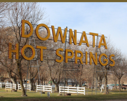
Downata Hot Springs – Downey, ID