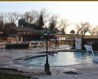
Crystal Hot Springs – Honeyville, UT