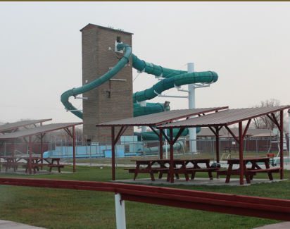
Riverdale Hot Springs – Preston, ID

Information: 435.279.8104; www.crystalhotsprings.net