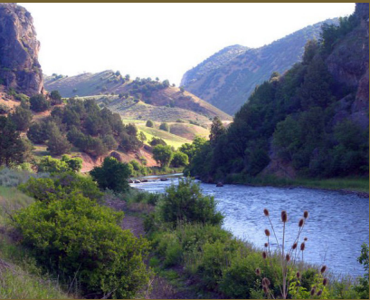
Oneida Narrows – near Preston, ID