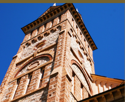
Paris Tabernacle – Paris, ID