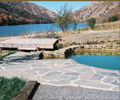
Maple Grove Hot Springs – Thatcher, ID