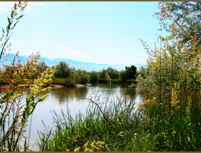
Bear River Bottoms – Trenton, UT