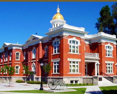
Cache County Courthouse – Logan, UT

This loop takes you through northern Utah and southeastern Idaho, following the meandering path of the Bear River. Learn about the natural and agricultural history of the region, mining and other industries, and the historic routes followed by the Northwestern Shoshone, explorers, pioneers, and early immigrants. You can do this loop in one long day, but it's much more enjoyable to allow two! Distance: 207 miles from town to town and back to Logan, add more depending on the side routes you take.