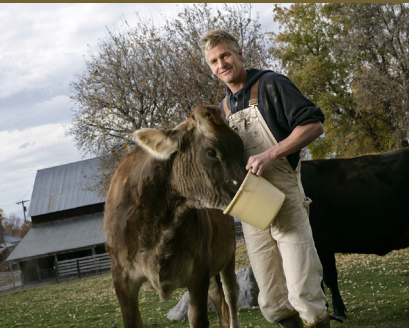
Rockhill Creamery – Richmond, UT