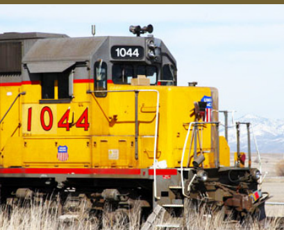
Union Pacific Railroad – Cache Junction, UT