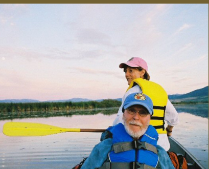
Canoeing the Cutler Marsh – Cache Valley, UT