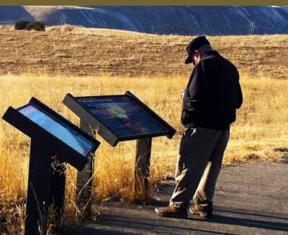
Bear River Massacre Site – Preston, ID