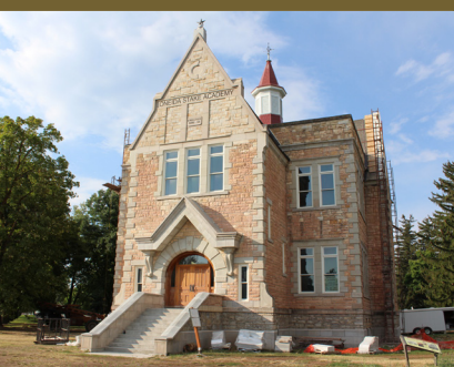
Oneida Stake Academy – Preston, ID