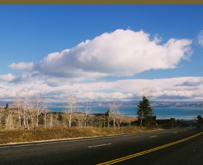
Bear Lake – Garden City, UT