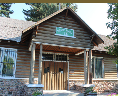
Relic Hall – Franklin, ID