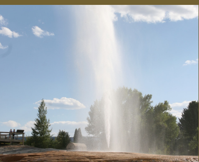
The Geyser – Soda Springs, ID